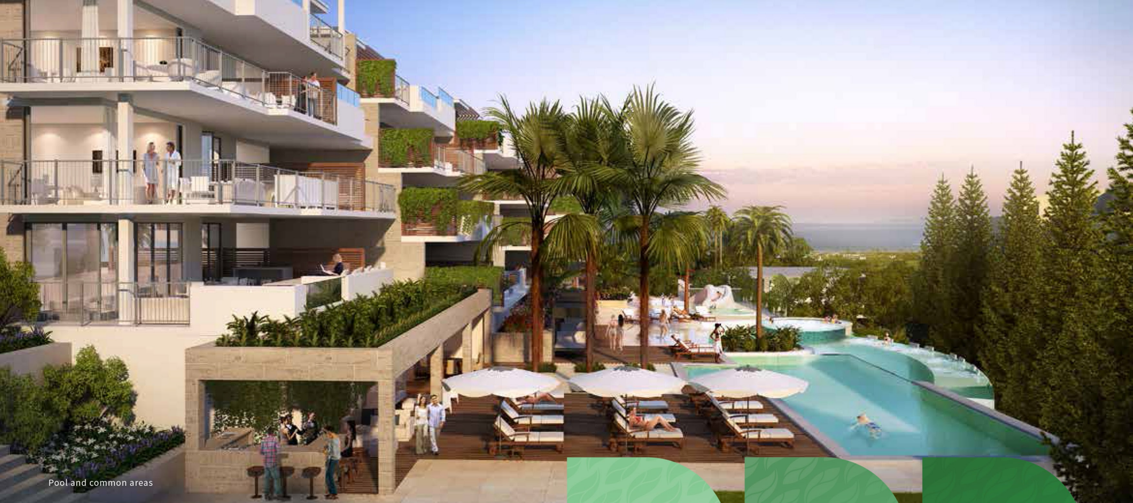
Pool and common areas