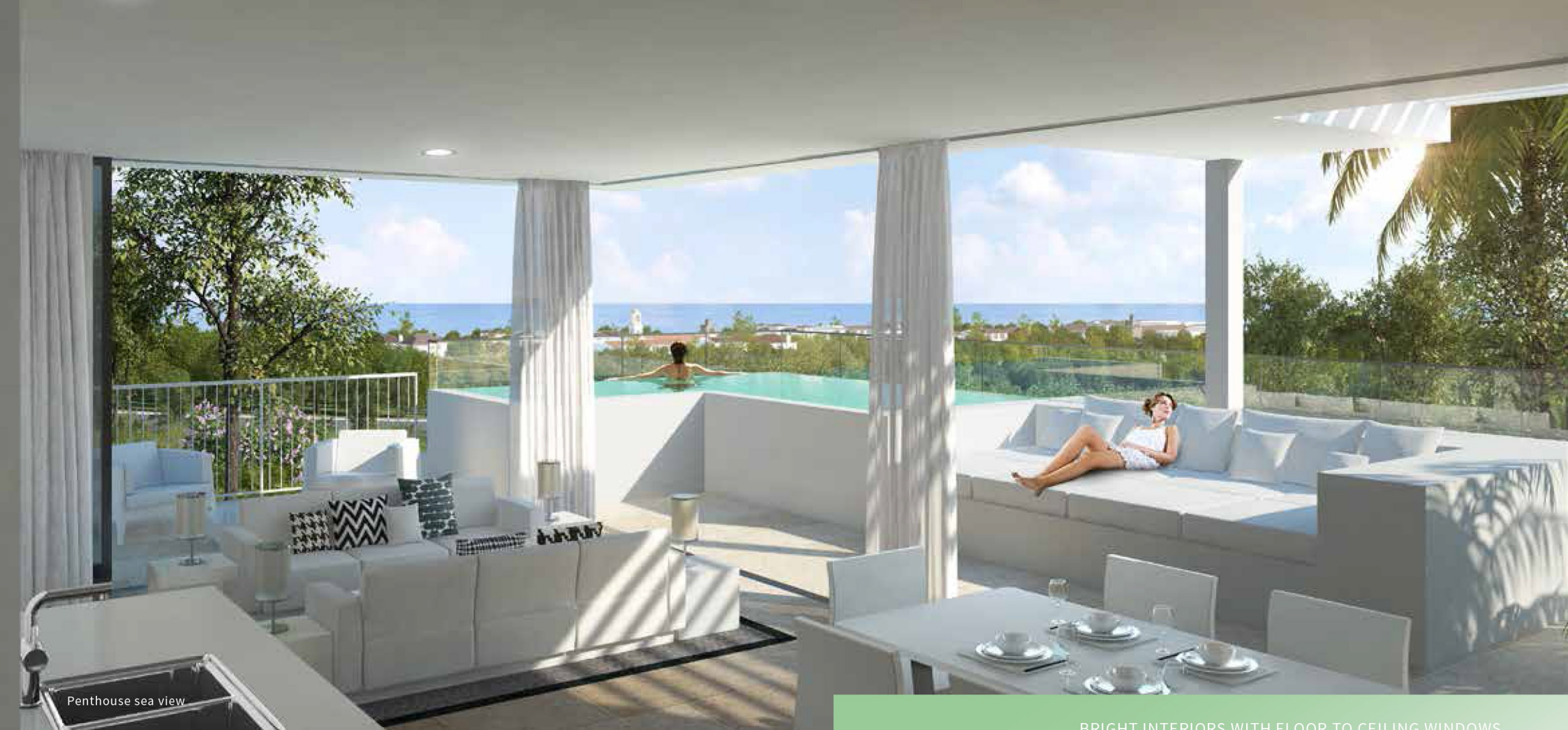
Penthouse sea view