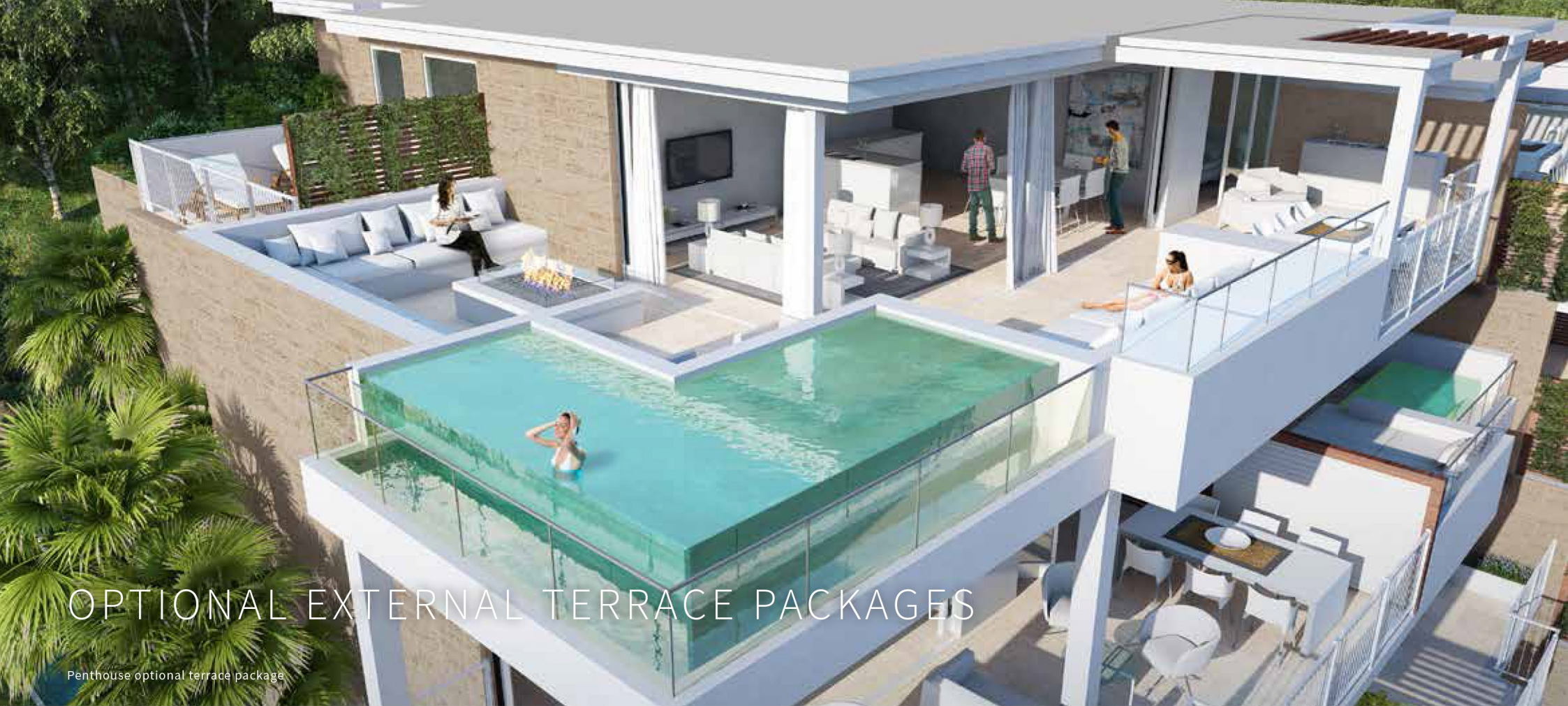
Penthouse optional terrace package