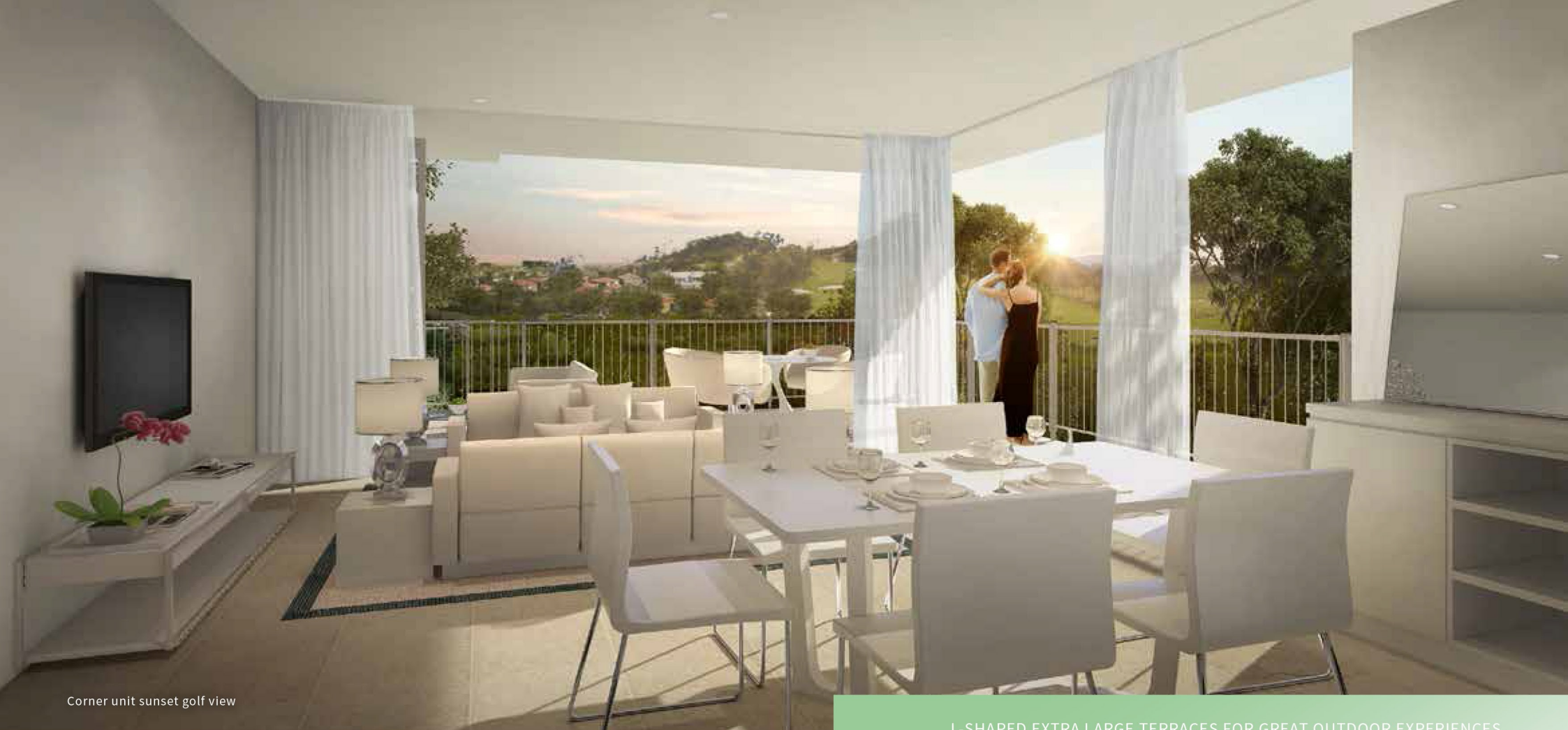
Corner unit sunset golf view