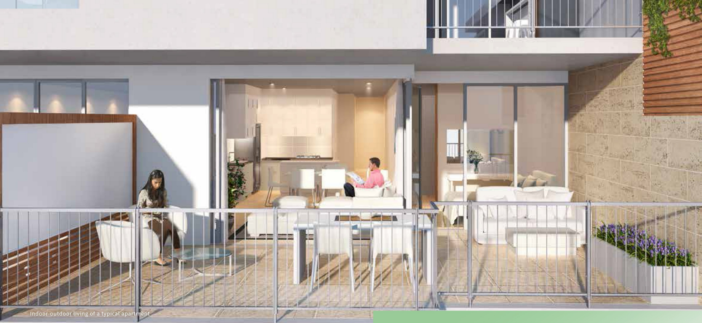
Indoor-outdoor living of a typical apartment

MODERN OPEN PLAN LIVING, DINING AND KITCHEN AREA