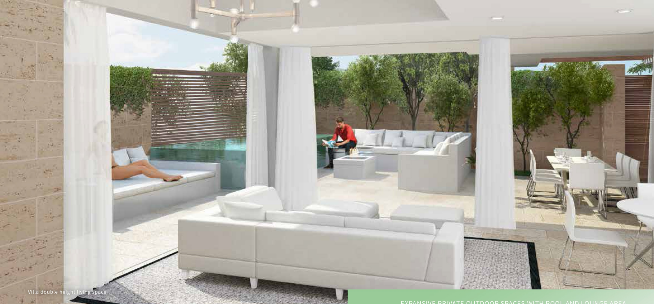
Villa double height living space